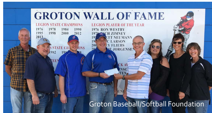
Groton Baseball/Softball Foundation