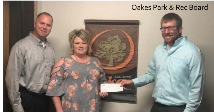
Oakes Park & Rec Board