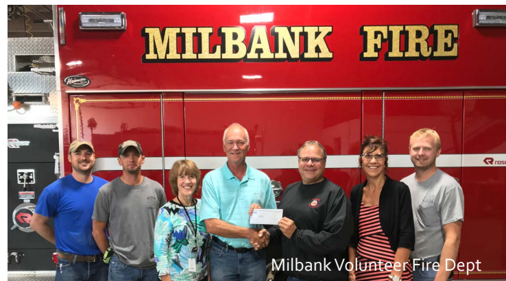
Milbank Volunteer Fire Dept